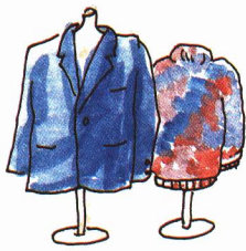
(着る物類) き いるい