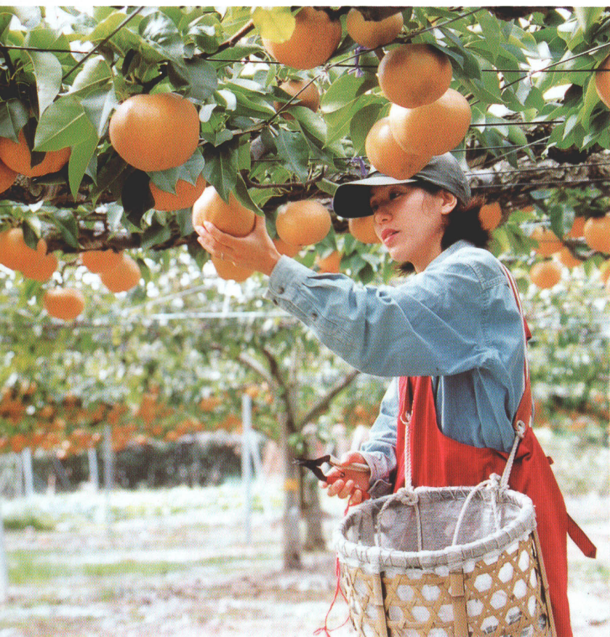
梨の収穫 Gathering pears

WE FOSTER THE GROWTH OF ACTIVE INDUSTRIES ROOTED IN REGIONAL CHARACTERISTICS